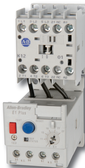
Bulletin 100-K Mini Contactor