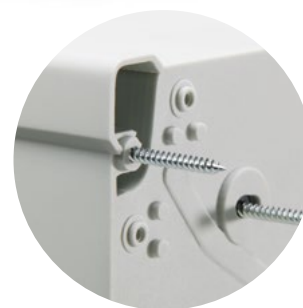
Multiple wall mounting options