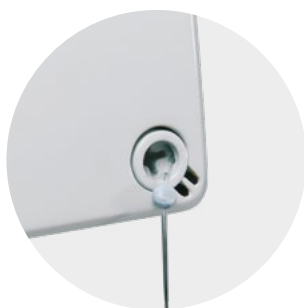
Sealing availability for added security