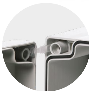
Quick-to-install integral hinge in selected sizes