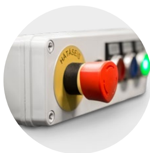
Designed for push-buttons