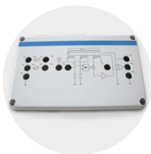
High-quality surface for printing