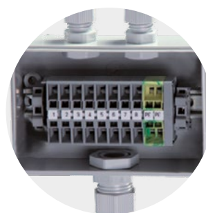
Optimised design for terminal blocks